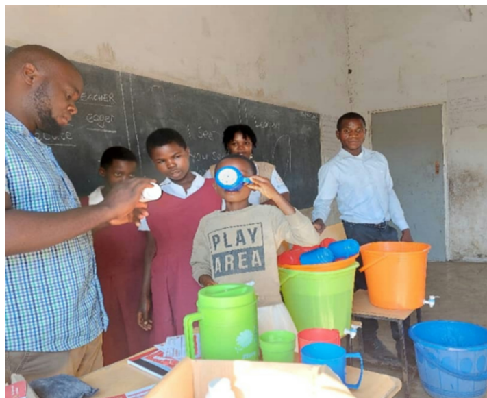
Learners receiving Iron Folic Acid tablets (IFA) at Tafika Primary School in Blantyre district.

Capacity Building of Teachers: In partnership with the MRCS, 243 teachers have been trained on cholera infection, prevention, and management across 121 schools in Blantyre, Chikwawa, Chiradzulu, Mulanje, Phalombe, and Thyolo districts, benefiting 167,379 learners (85,081 males and 82,298 females). This initiative is part of the UNICEF supported 'Back-to-School' campaign, targeting 300 teachers in 250 schools.